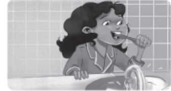
B. brush my teeth