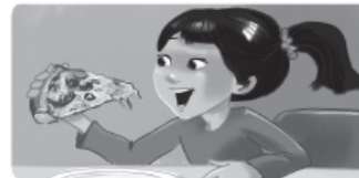
C. eat pizza