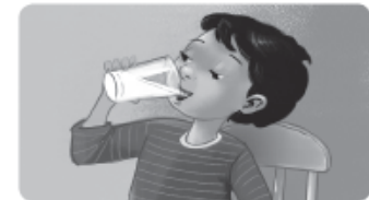
D. drink milk