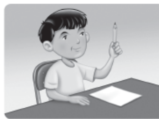
B. Pick up your pencil.