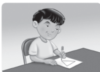
C. Draw a triangle.