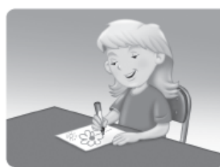
D. Draw a picture.